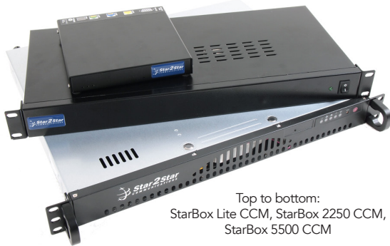
Top to bottom: StarBox Lite CCM, StarBox 2250 CCM, StarBox 5500 CCM

Your business is unique, so you shouldn't have to settle for a one-size-fits-all communications solution. At Star2Star, we've been making intelligent, Internet-based communications systems for seven years. Everything we've learned is embodied in the latest versions of our StarBox Cloud Connection Managers. One of them is just right for your business.